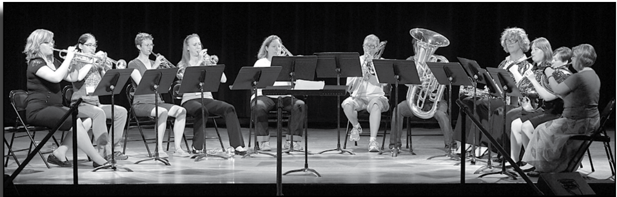
Adult Amateur Ensemble