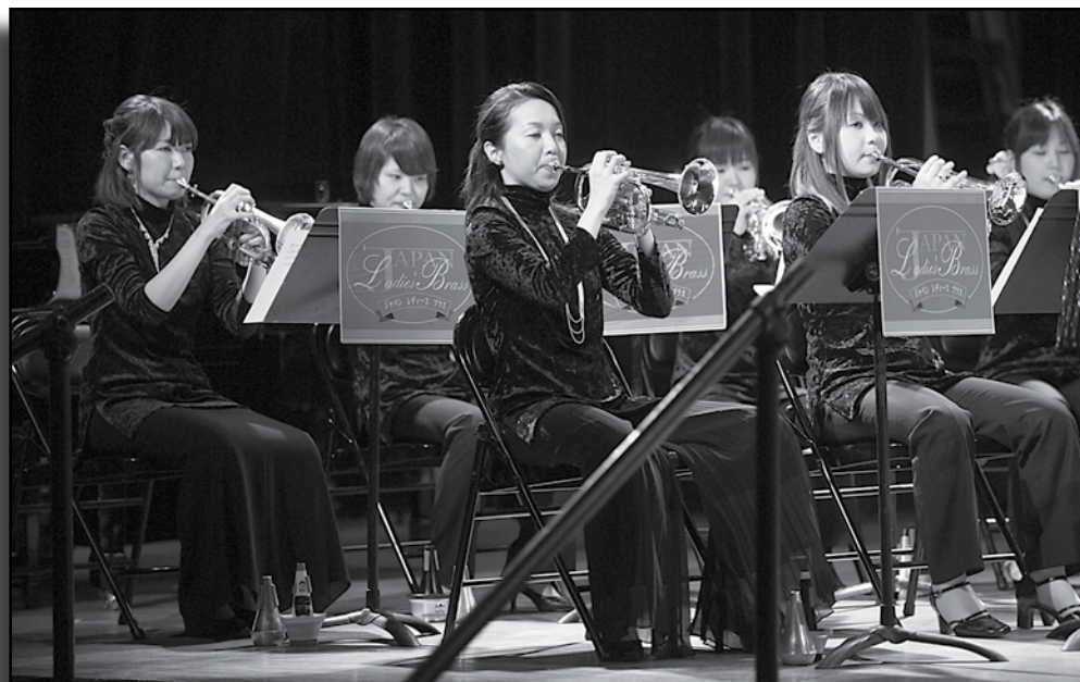
Japanese Ladies Brass Band