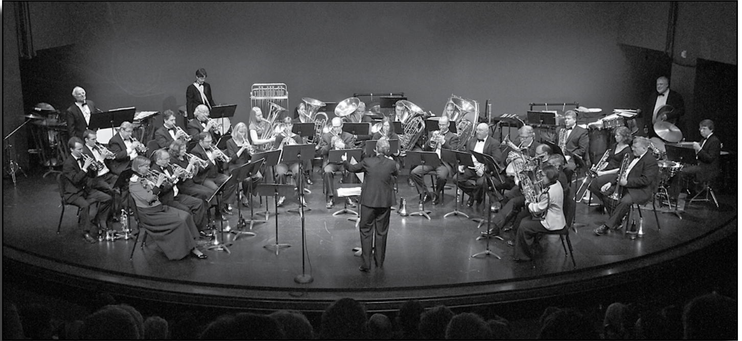
Hannaford Street Silver Band with "The Brass Belles"