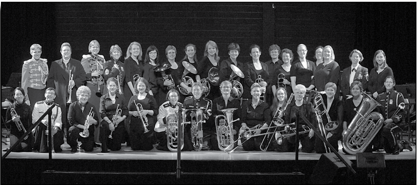
Monarch Brass Ensemble