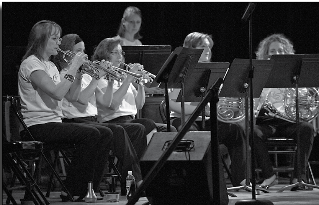
Viceroy Brass Ensemble